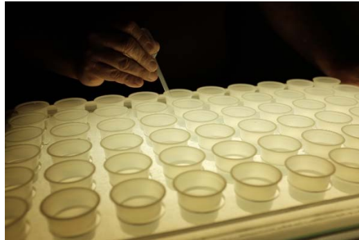
2 nd Place Water Fleas Merli Aligmanto